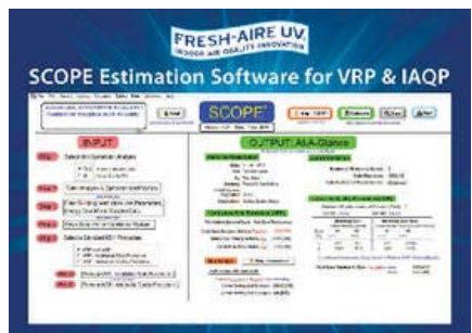
Fresh-Aire UV® SCOPE(TM) Estimation Software Calculates Outdoor Air and ROI for ANSI/ASHRAE 62.1's VRP & IAQP Click Here to Enlarge Picture

SCOPE™ takes the guesswork out of calculating minimum outdoor air and outputs energy savings and ROI results to a color printout for presentations and LEED point confirmation.